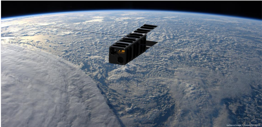
An artist's impression of PicSat in orbit around the Earth.